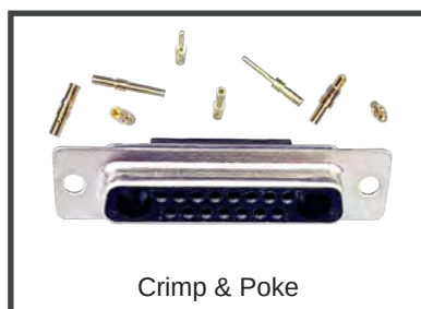
Crimp & Poke