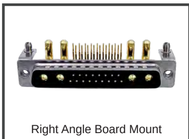
Right Angle Board Mount