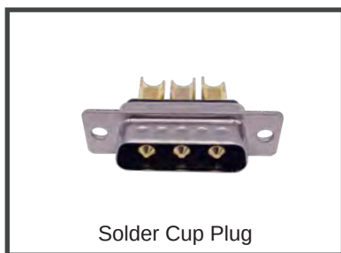
Solder Cup Plug