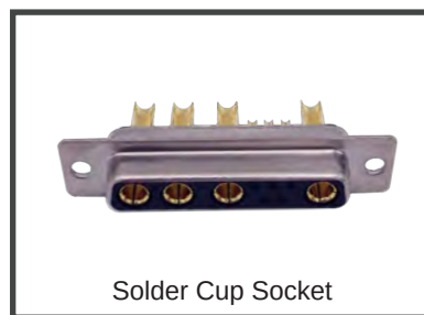
Solder Cup Socket

Screw machined contacts for high mating cycles